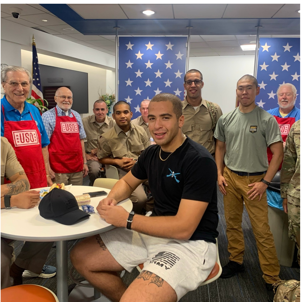
The USO Georgia Team is sincerely thankful for the Dunwoody Rotary Club and for each member who served lunch through our Meet & Treat program on Thursday, September 20, 2023.

It is always a pleasure to watch your group interact with the service members and their families. Everyone always serves with a smile and keeps the USO Atlanta Center a relaxing place to rest while traveling. We also want to thank you, Dunwoody Rotary Club, and the multiple vendors for your generous donations. Service members, including recent graduates, and their families thoroughly enjoyed the snacks, homemade cookies, fresh fruit, hot dogs, and more! [more]