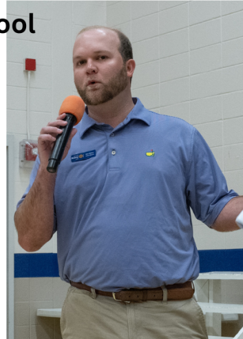
Comedy for a Cause