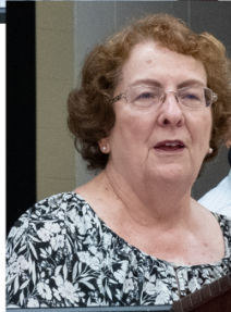
Last Week at Rotary