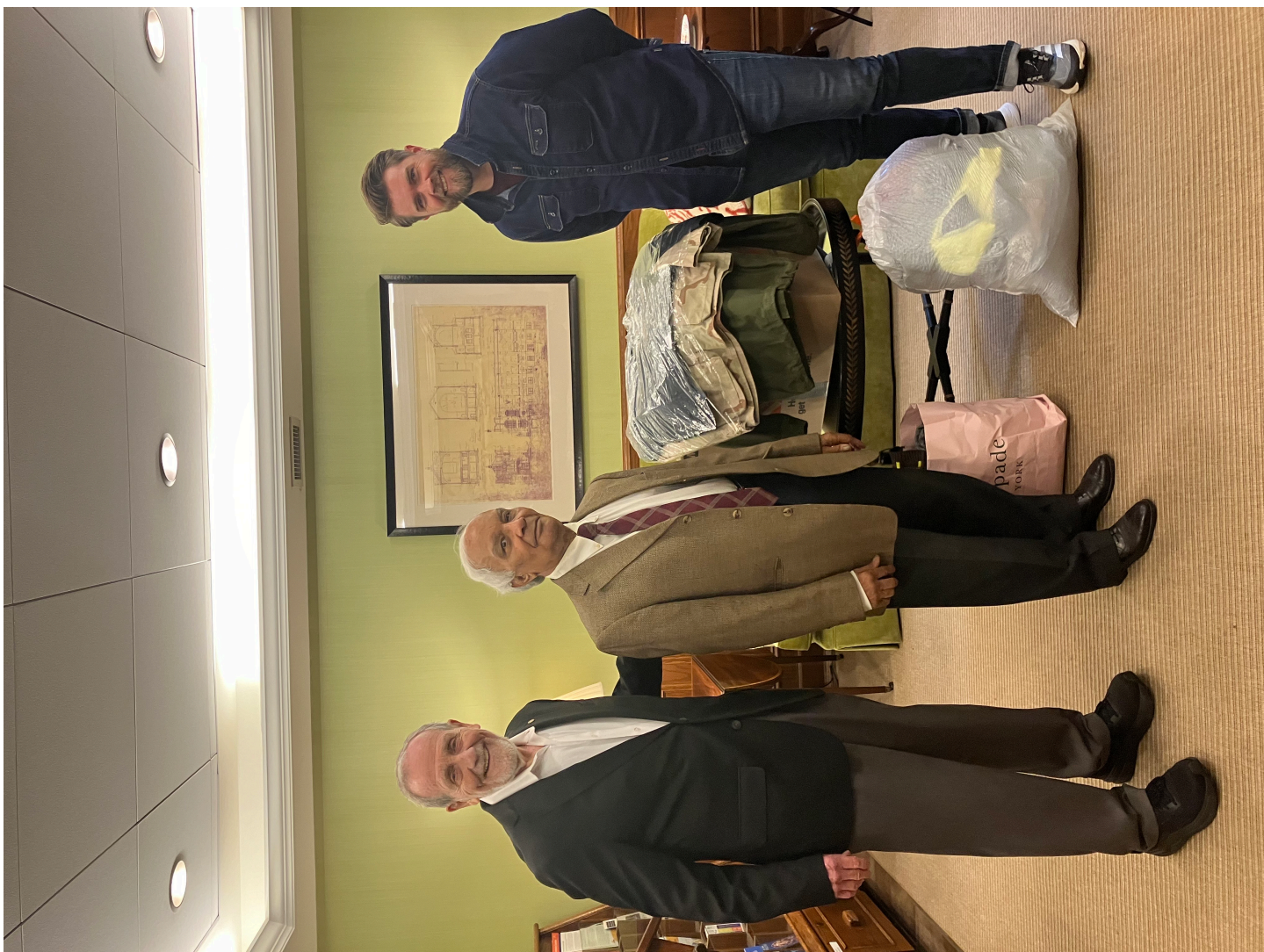
Posted by Angeli Abrol Duggal January 3, 2025