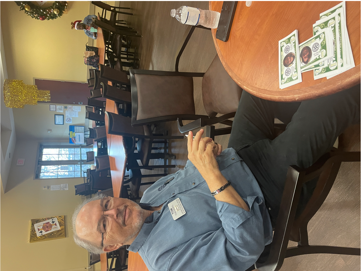
Posted by Claudia Mertl January 3, 2025