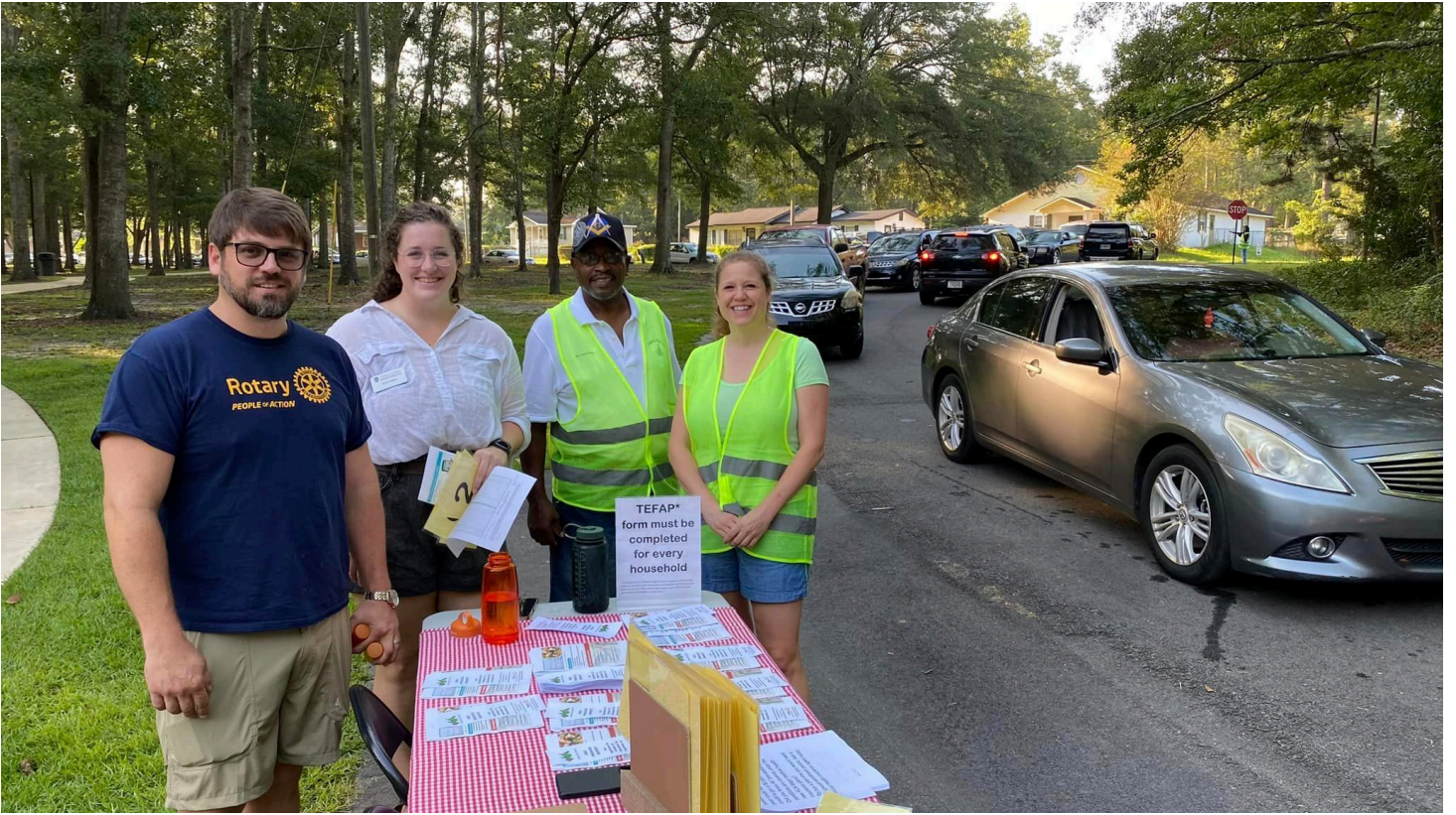
One hundred vehicles were already lined up prior to opening the Fresh Produce Market that morning!